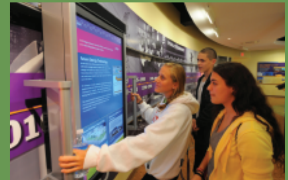
High school students learned about opportunities in engineering while touring PSEG as part of Rowan’s Introduction for Students to Engineering.