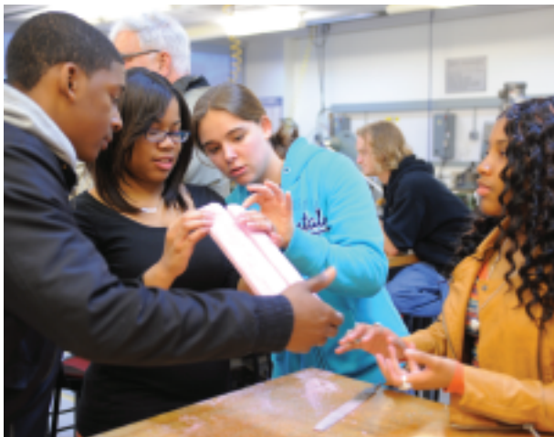
The Society of Women Engineers at Rowan sponsored Flying Bananas, working with C.H.A.M.P. students to build foam gliders designed to carry a banana and fly from the second floor of Rowan Hall.

Student professional societies also include chapters of the American Institute of Chemical Engineers, American Society of Civil Engineers, Engineers Without Borders, IEEE, New Jersey Water Environment Association and Tau Beta Pi National Engineering Honor Society.