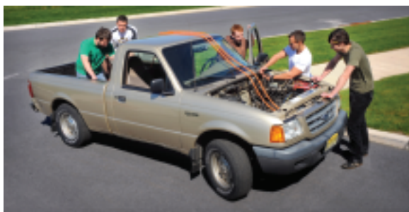
Students work to convert a 2003 Ford Ranger to an all-electric vehicle.