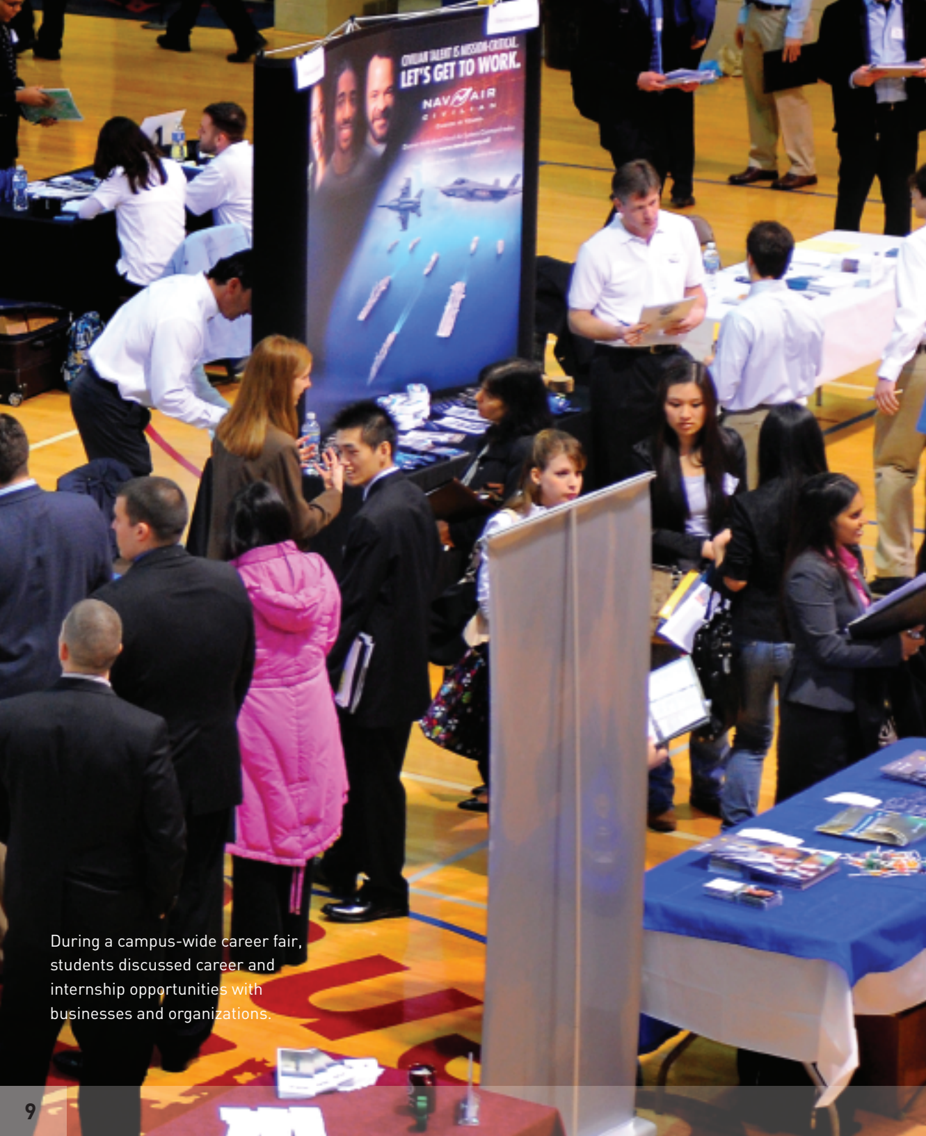
During a campus-wide career fair, students discussed career and internship opportunities with businesses and organizations.