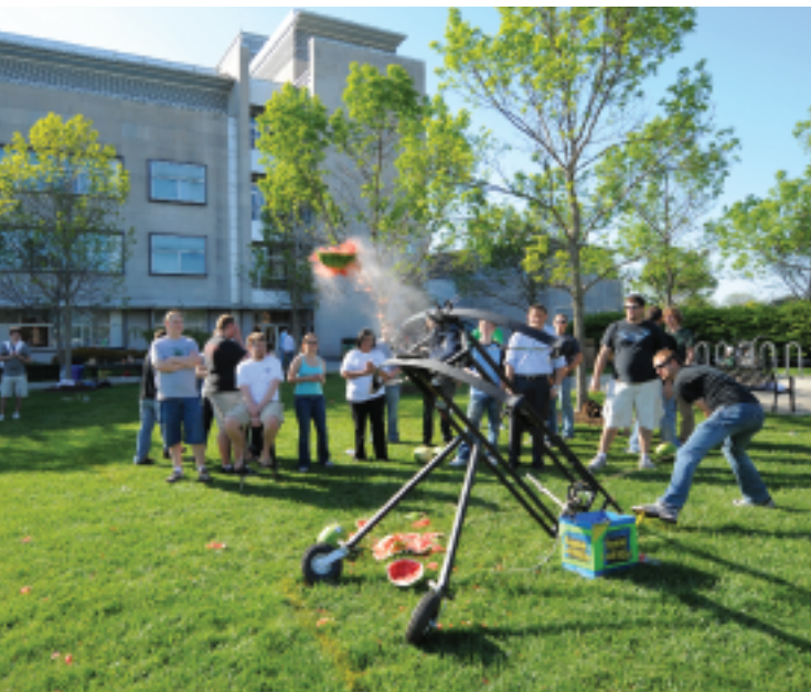
During the second annual Melon Propellin', contestants launched watermelons at targets using catapults they designed and built.