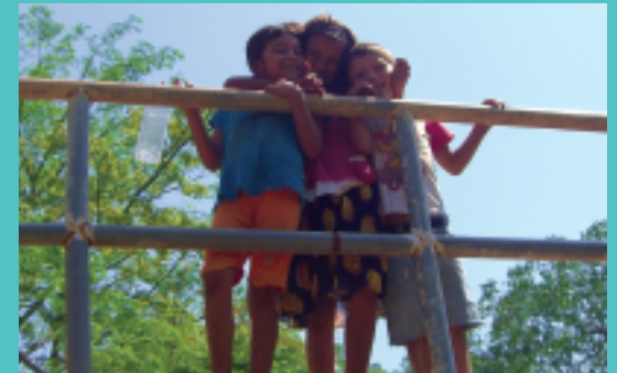
Three children from La Ceiba pose for the camera.