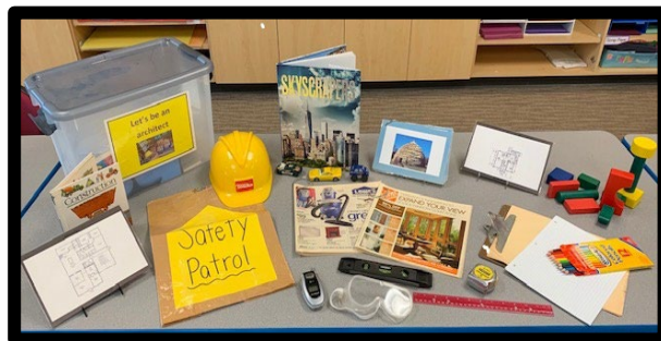
Architect Prop Box