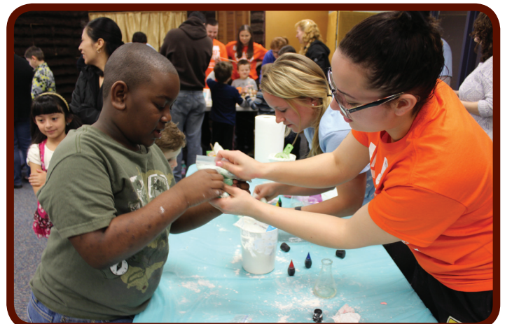
Students from the Department of Health & Exercise Science volunteer with the Make & Move Club during NJ Makers Day.