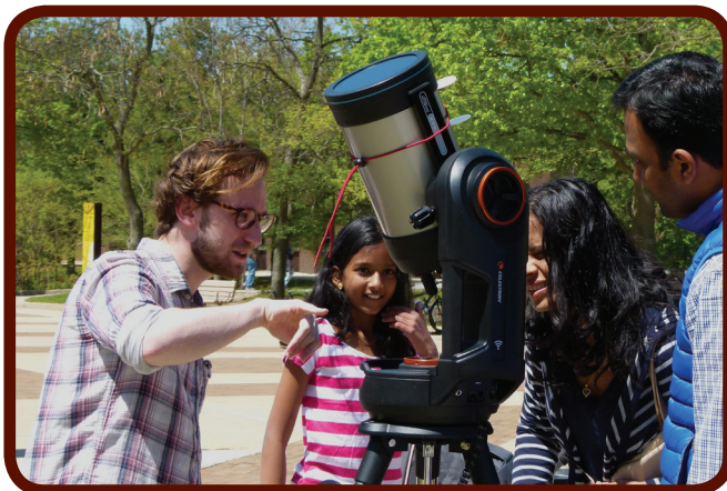
Visitors to Rowan University for Philadelphia Science Festival's Explorer Sunday view the sun through a solar telescope.