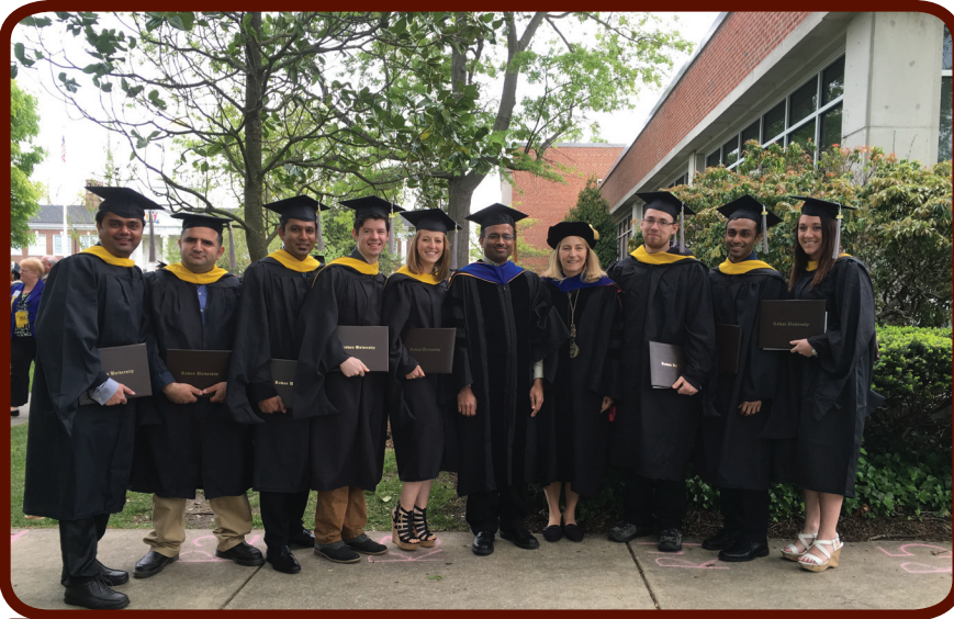
First graduating class of Master of Science in Pharmaceutical Sciences.