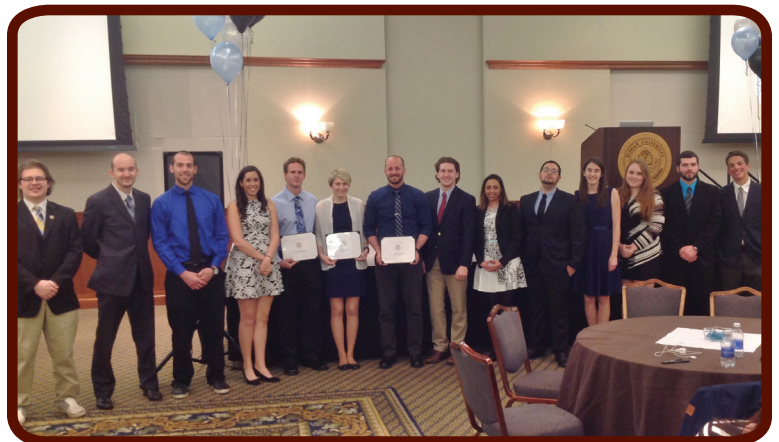
The Executive Board of the Pre-Health Society celebrates the first annual Make-A-Wish fundraiser.