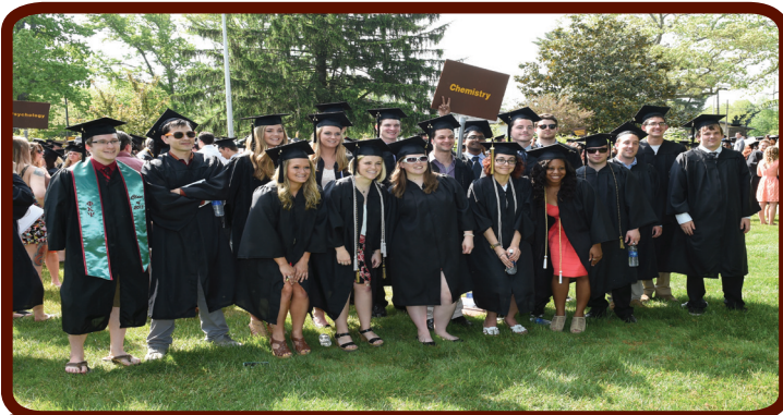
Chemistry majors at Commencement on May 12.