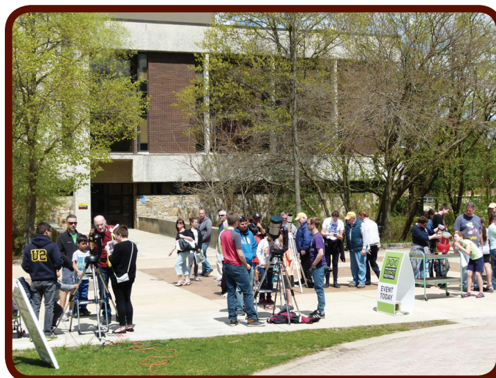
Visitors line up to safely view the sun on Explorer Sunday.

Following Astronomy Night, Rowan played host to Explorer Sunday. Various family-friendly activities took place across campus, many of which were offered at Science Hall. Many of the youngest visitors enjoyed creating hexaflexagons and a Menger sponge with members of the Math Team, while others took part in