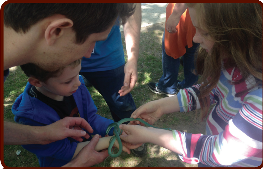
Visitors meet reptiles at the Rowan University tent during the Carnival on the Parkway as part of the Philadelphia Science Festival.