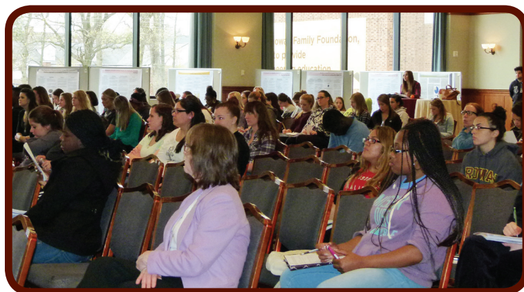
Audience members listen to a presentation at the 41st Annual Psychology Research Conference