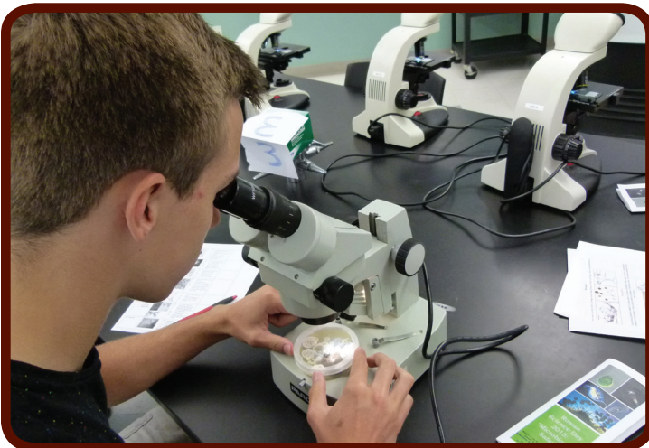
Discovering moldy bread through a microscope during CSM's Science Day, which welcomes high school students from across South Jersey.