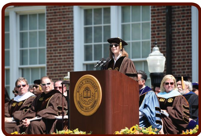
Astronaut Dr. Bonnie J. Dunbar addresses Commencement for the College of Science & Mathematics, School of Biomedical Science and Health Professions, and the Henry M. Rowan College of Engineering.