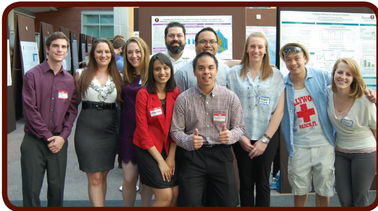
Rowan University students and professors at the 2015 SJACS Undergraduate Research Symposium